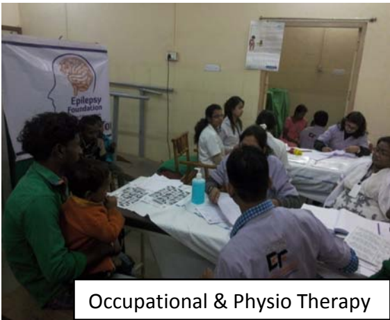
Occupational & Physio Therapy